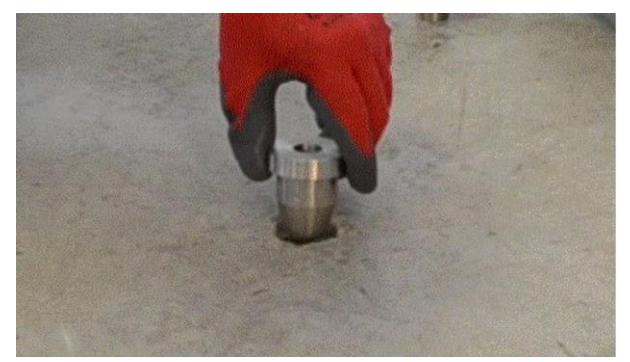
Figure 3. Testing Depth with the Drilling Guide

4) Remove cuttings from the hole and place the Drilling Guide in the hole with the conical end down (Figure 3). The hole is sufficiently deep if the flange of the Drilling Guide lies flush with the surface of the slab. Deepen the hole as necessary, but avoid drilling more than 2 inches into the slab, as the threads on the Secure Cover may not engage properly with the threads on the VAPOR PIN®.