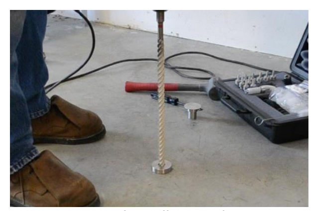
Figure 4. Using the Drilling Guide

7) Screw the Secure Cover onto the VAPOR PIN® and tighten using a #14 spanner wrench by rotating it clockwise (Figure 5). Rotate the cover counter clockwise to remove it for subsequent access.