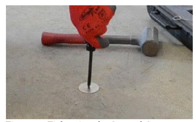
Figure 5. Tightening the Secured Cover

7) Screw the Secure Cover onto the VAPOR PIN® and tighten using a #14 spanner wrench by rotating it clockwise (Figure 5). Rotate the cover counter clockwise to remove it for subsequent access.