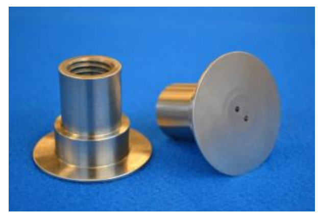
Figure 1. VAPOR PIN® Secure Cover